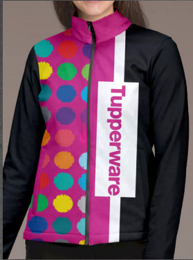
Mens & Ladies Brushed Fleece Jackets