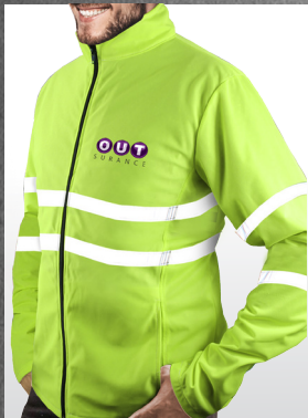
Mens & Ladies High Visibility Jackets