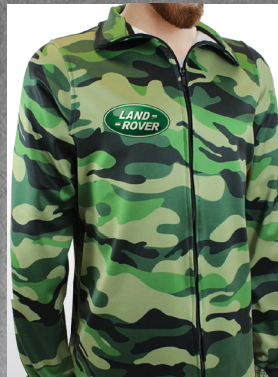
Mens & Ladies Camo Jackets