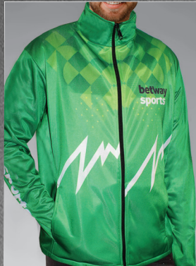
Mens & Ladies Triacetate Jackets