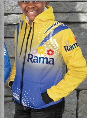
Kids full zip Hoodies