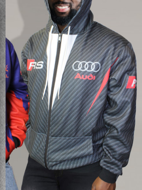
Mens & Ladies Full Zip Hoodies