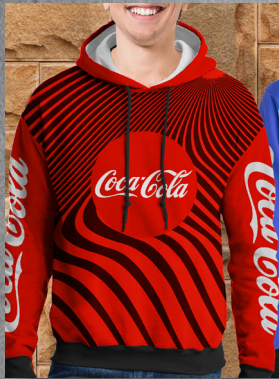
Mens & Ladies No-pocket Hoodies