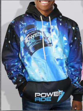
Mens & Ladies Hoodies