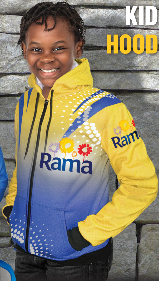
Kids Sublimated Brushed Fleece Hooded Sweater