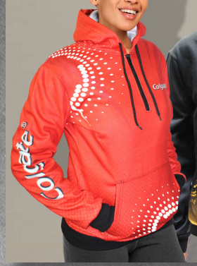
Mens & Ladies 1/4 Zip Hoodies