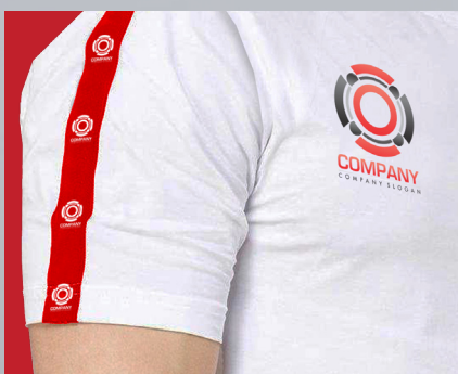
20mm Sublimated supreme petersham tape on shoulders & sleeves